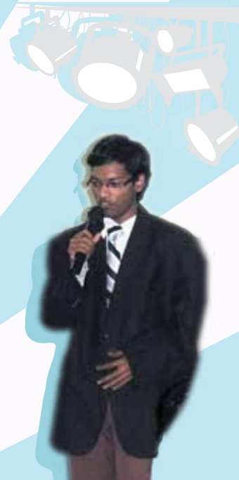
A Bol Bindaas Class student speaks confidently in public

The Bol Bindaas classes have now been running for more than two years. The training imparted has given students the freedom to converse anywhere, anytime on any topic, be it for professional, academic or even personal fulfillment. It has brought out a new dimension in their personality, enhanced their social skills and opened up exciting new avenues for immeasurable growth!