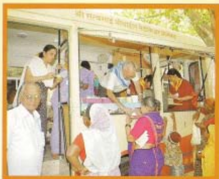
Medical Camp at Ghatkopar