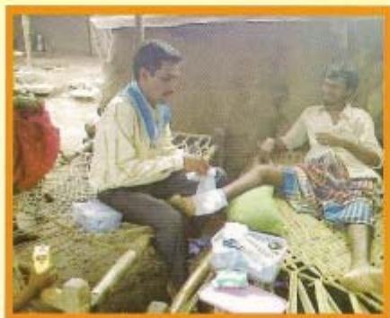
Serving the poor - Washim Dist.