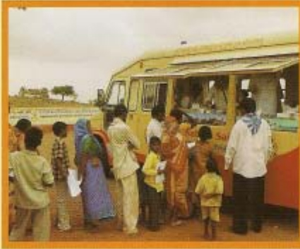
Medical Camp - Tulapur Village