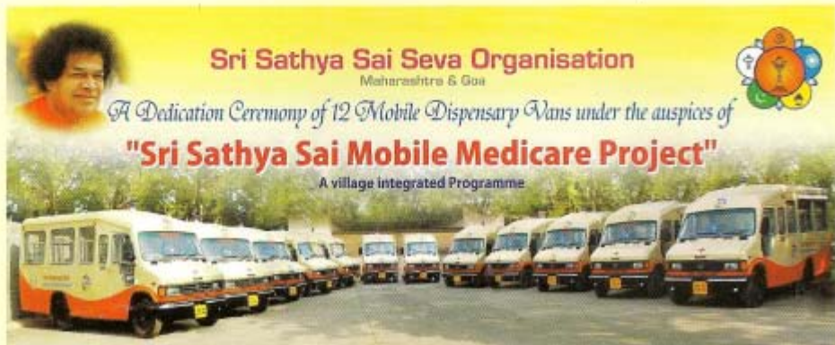
File Photograph of the mobile vans during inauguration