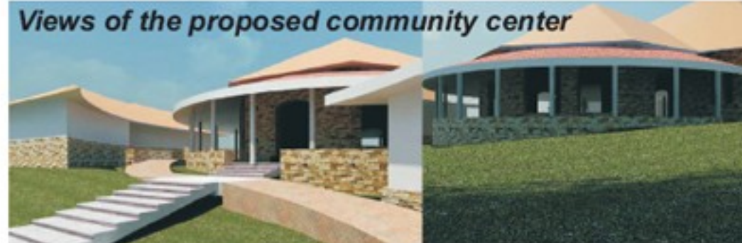
Views of the proposed community center