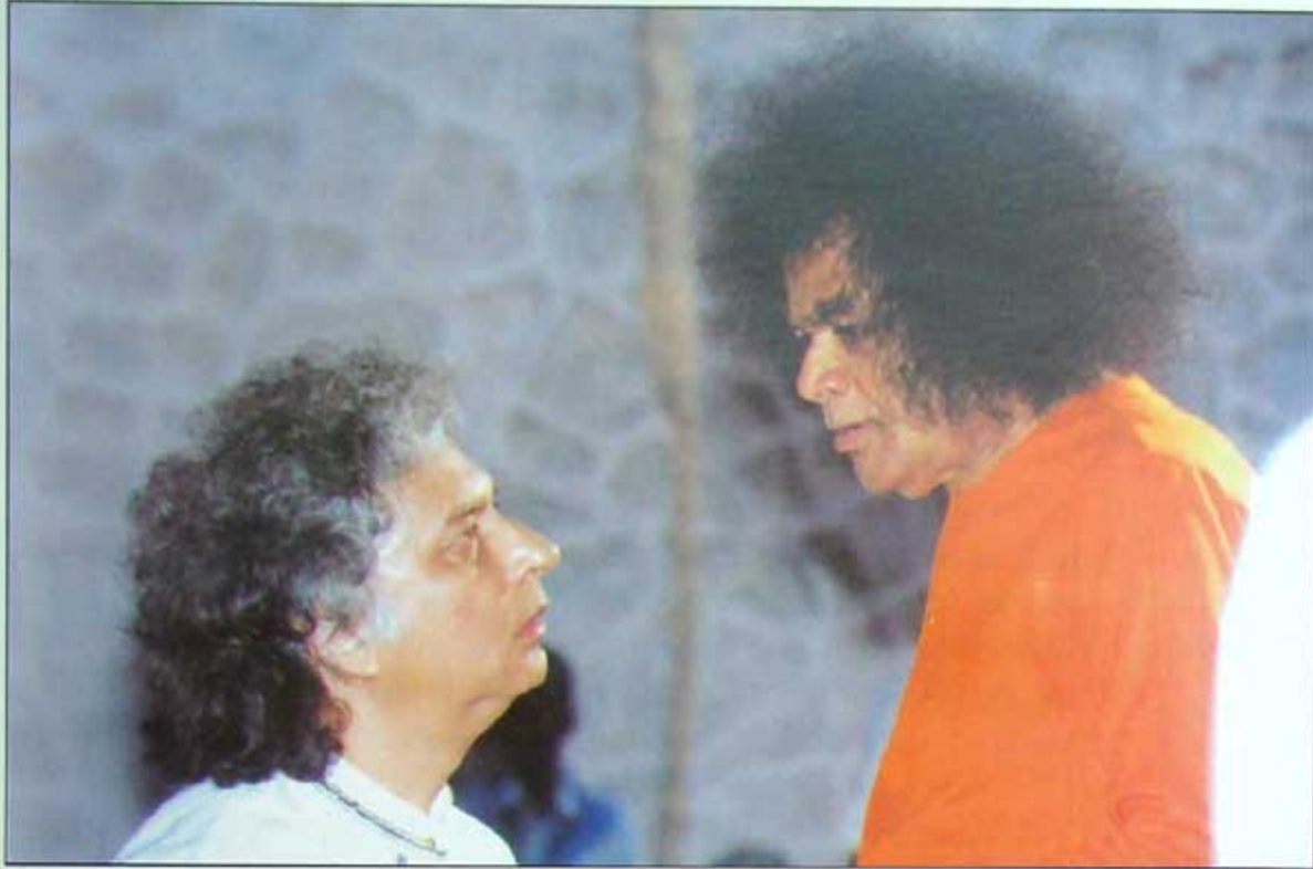
The Guru Shishya Parampara continues with Bhagawan in intimate conversation with Pandit Shiv Kumar Sharma the Santoor Maestro - Dharmakshetra 1999.