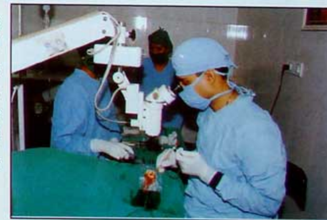
Cataract operation in progress

One should see that no harm occurs to anyone an account of one's actions.