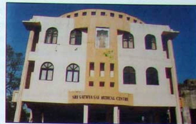
Sri Sathya Sai Medical Centre

The Medical Centre has now started an Alternate Medical Treatment in Vibrio Therapy, especially for chronic patients. Acupressure and other alternate preventive methods of diet control, health & hygiene are also available.