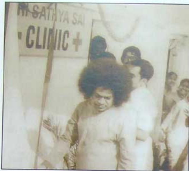
Bhagawan visiting clinic during His visit

Medical Seva had a beginning right from the inception of Dharmakshetra in 1968, when doctors visited on Sundays, bringing their own kit and medicines, and met with patients in an open shed. A better equipped Sri Sathya Sai Clinic was inaugurated by Bhagawan Baba in 1974. The Allopathic treatment available earlier was expanded to include Homeopathy and Dental treatment. Doctors also started visiting on weekdays. Bhagawan Baba invariably visited the Clinic when He came to Dharmakshetra.