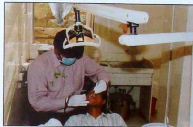
Dental treatment at the Medical centre

2004, was 23,430, i.e. almost 2000 per month. The Dharmakshetra Centre provides each year Oral and Preventive Health Care to the 900 students of Sri Sathya Sai Vidya Mandir, Sometimes, some other schools also seek this assistance.