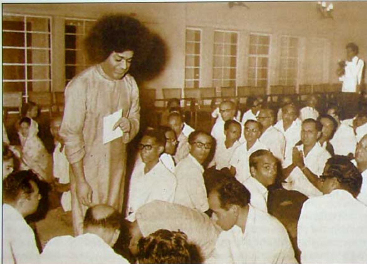
The beginning of Sri Sathya Sai Seva Dal... A historic occasion when Bhagawan inaugurated the first Sri Sathya Sai Seva Dal at Worli Dairy Hall in 1967