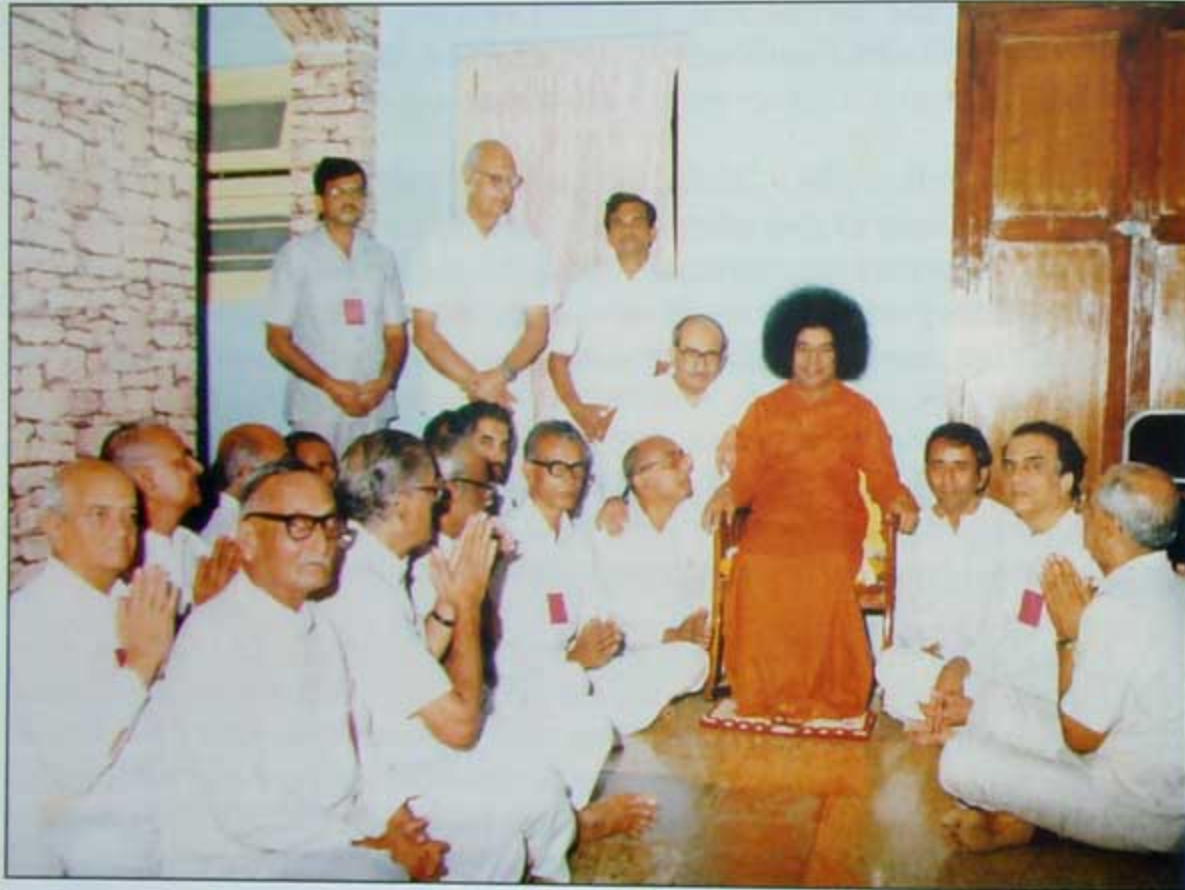
A rare photograph of Bhagawan with Samithi Members of Mumbai (1986) in Dharmakshetra.

All have grown out of one single small seed! And, every fruit of that tree has seeds of the same nature inside it! So too, contemplate for a while on the magnificent multitude of life, all its rich variety of strong and weak, prey and hunter, distressed and delighted, creeping, crawling, flying, floating, walking hanging, burrowing, diving, swimming-all this uncountable variety of created beings have come out of the 'beejam' (Lord) and each of them has in its care, the beejam, again!