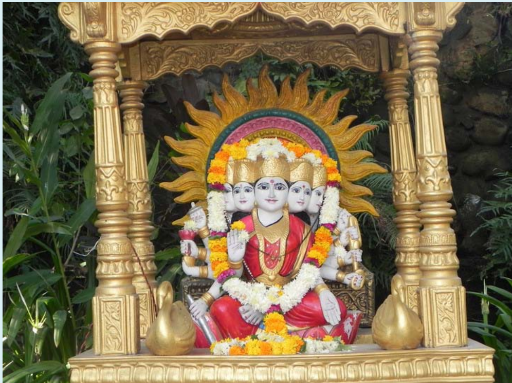
The Gayatri Idol at Dharmakshetra